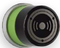
BLACK & GREEN